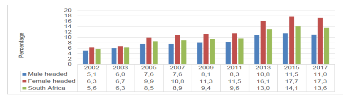
Figure 17 Percentage of households that received a government housing subsidy by sex of the household head, 2002–2017