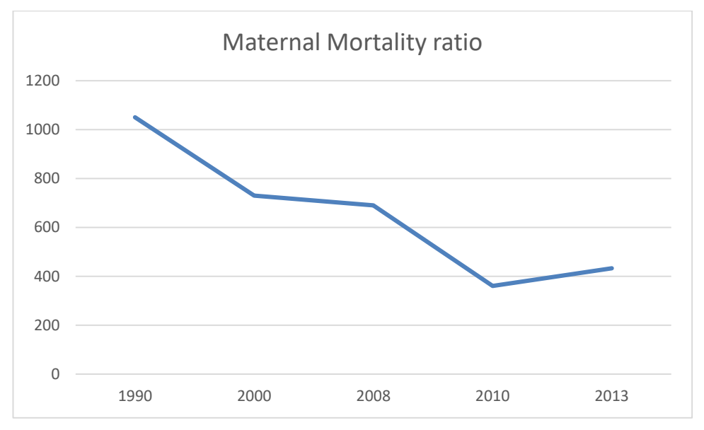
Table: Maternal Mortality ratio.