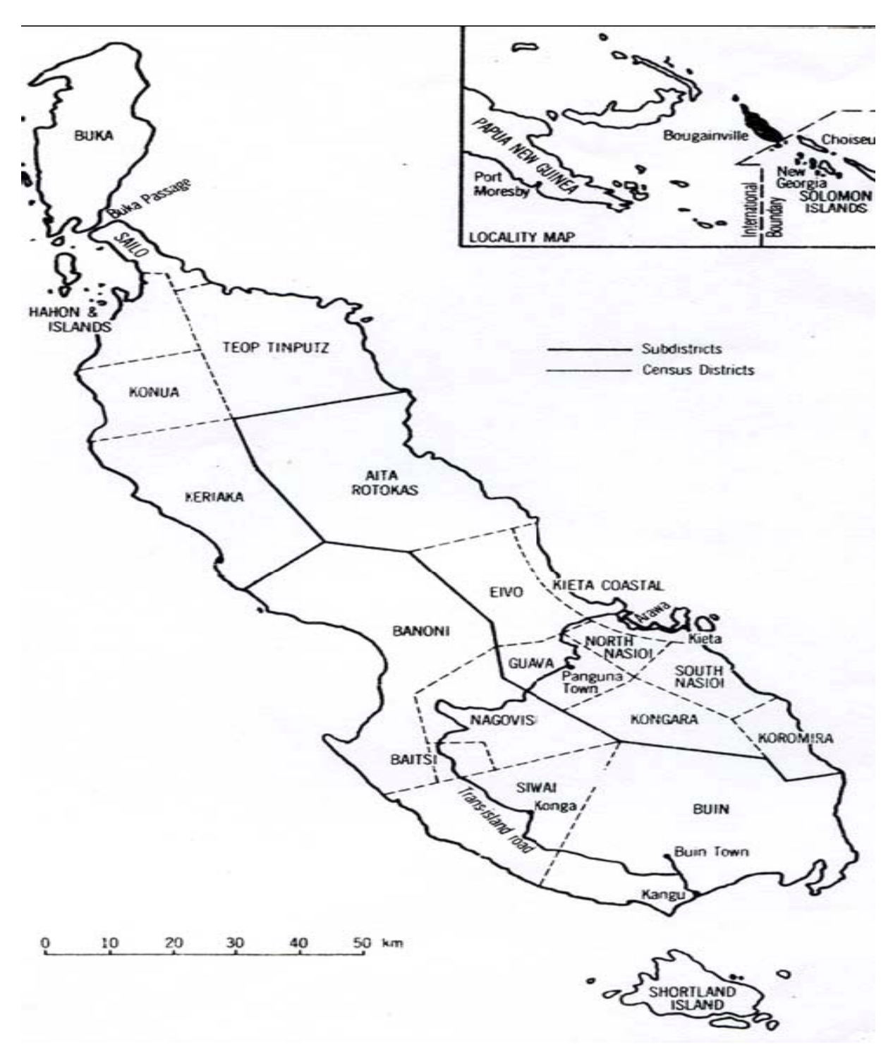
Part B – Autonomous Region of Bougainville

From: The Journal of Pacific Studies Vol. 28 no.2, 2005