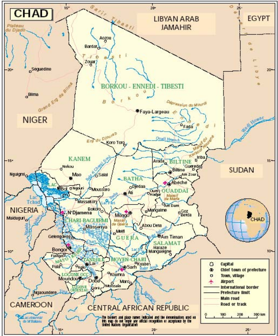
Map No. 3788 (F) Rev. 3 United Nations October 2005

Department of Public Information Cartographic Section