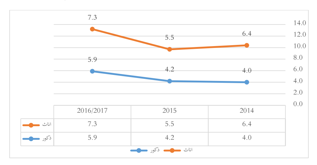
[Blue = male; orange = female].

44. According to the results of a labour force survey, the unemployment rate in Kuwait fell to 2.2 cent in 2015 and remained unchanged in 2016/2017. By comparison, the unemployment rate was 2.9 per cent in 2014. The unemployment rate among men decreased to 0.9 per cent in 2016/2017 compared to 1.9 per cent in 2014, while for women it increased to 5.8 per cent in 2016/2017 from 4.4 cent in 2015. The unemployment rate among Kuwaiti nationals was 6.4 per cent in 2016/2017 (5.9 per cent for men and 7.3 per cent for women), whereas it was 1.7 per cent for non-nationals in the same period (0.5 per cent for men and 5.5 per cent for women). The following graph shows unemployment among Kuwaiti nationals by gender according to the last three labour force surveys (2014, 2015, 2016/2017).